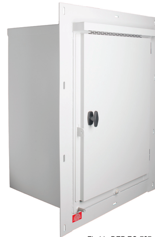
Florida DEP EQ-787

Rough opening dimensions for mounting • Width = 24.875" • Height = 33.375"