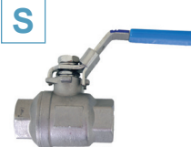
691BSS Ball Valve