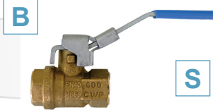
691 Ball Valve